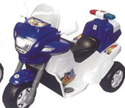
PC-312 L98 X W47 X H63 CM