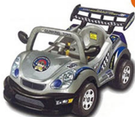
PC-7111 L95 x W62 x H53CM