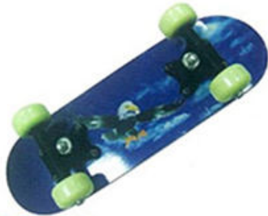
PC-0201 MINI SKATE BOARD SK-17*5PP DOUBLE KICK SHAPE 608Z STEEL BEARING AND PVC WHEELS 12PCS/CTN/1.90CUFT 15000PCS/HQ