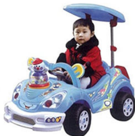
PC-7255-2 L95 x W62 x H53CM