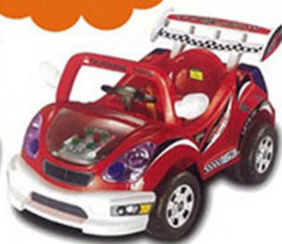
PC-7299 L95 x W62 x H53CM