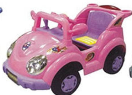
PC-801P L95 x W60 x H55CM