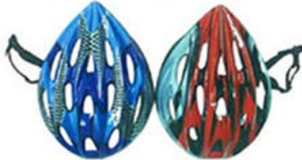
PC-0408 WITH PRINTING PVC OUTSIDE/EPS INSIDE 24PCS/CTN/6.14CUFT