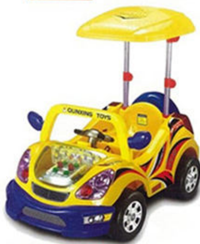
PC-7299-2 L95 x W62 x H53CM