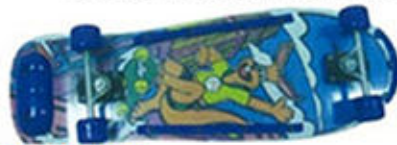
PC-0207 SK-30*10AP SKATE BOARD ALUMINIUM TRUCK AND PP BASE 55*47MM PVC WHEELS 608Z BEARING 4PCS/CTN/2.02CUFT 4800PCS/HQ