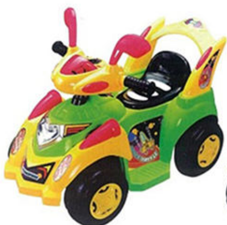
PC-802-2 L75 x W40 X H58.5CM