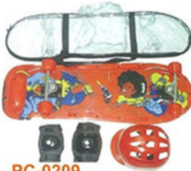
PC-0209 SK-30*10APS SKATE BOARD FULL SET ALUMINIUM TRUCK AND PP BASE 55*47MM PVC WHEELS 608Z BEARING KNEE AND ELBOW AND HELMET AND BAG 4SETS/CTN/2.50CUFT 3800SETS/HQ