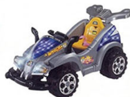
PC-7155 L120 x W65 x H60CM