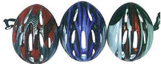
PC-0406 WITH PRINTING PVC OUTSIDE/EPS INSIDE 24PCS/CTN/6.14CUFT