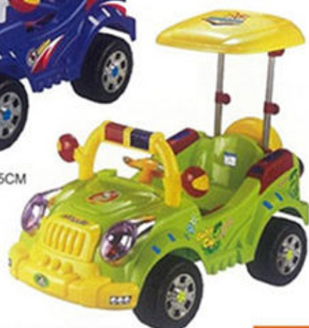
PC-7144-2 L103 x W62.5 x H54.5CM