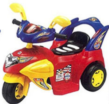
PC-303 L91 x W48 x H81CM