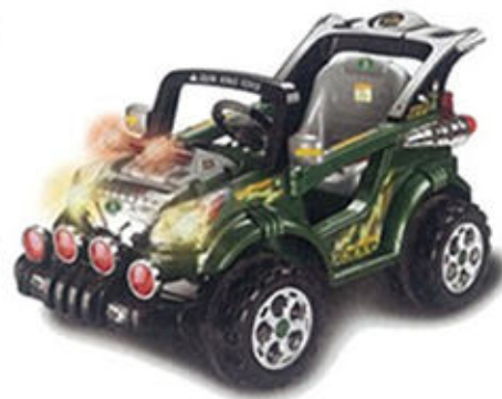
PC-7199 L118.5 x W71 x H69CM