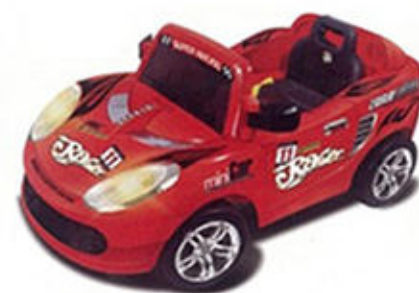
PC-7433 L115 X W67.5 X H49.5 CM