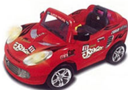
PC-7266-3 L115 x W67.5 x H49.5CM