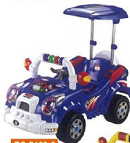
PC-7133-2 L103 x W62.5 x H54.5CM