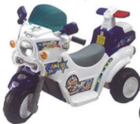
PC-310 L116 X W55 X H76 CM