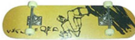
PC-0205 SK-31*8AA DOUBLE KICK PROFESSIONAL STYLE FULL ALUMINIUM TRUCK AND BASE 50*30MM PVC WHEELS 608Z STEEL BEARING 4PCS/CTN/2.02CUFT 4800PCS/HQ