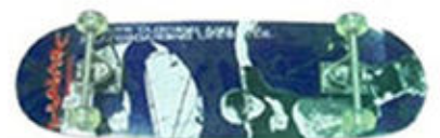
PC-0206 SK-28*8AA DOUBLE KICK FULL ALUMINIUM TRUCK AND BASE 50*30MM TRANSPARENT WHEELS 4PCS/CTN/1.58CUFT 6080PCS/HQ