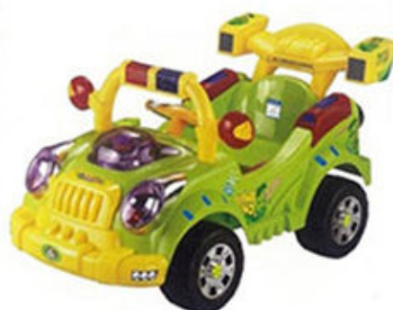
PC-7122 L103 x W62.5 x H54.5CM