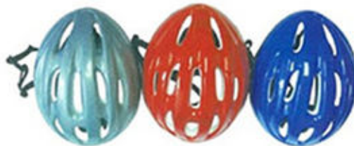
PC-0405 SOLID COLOR PVC OUTSIDE/EPS INSIDE 24PCS/CTN/6.14CUFT