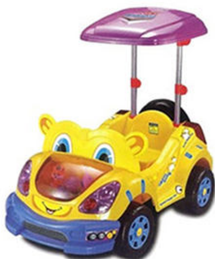
PC-7288-2 L95 x W62 x H53CM