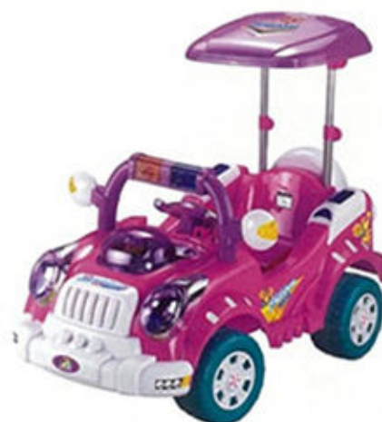
PC-7122-2 L103 x W62.5 x H54.5CM