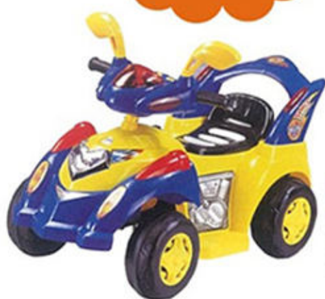
PC-802 L97 x W48 x H86CM