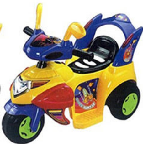
PC-303-3 L73 x W40 x H58.5CM