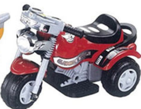
PC-305 L80 x W46 x H49CM