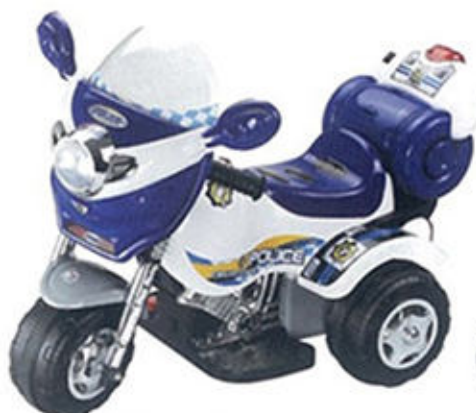
PC-308P L80 x W46 x H60CM