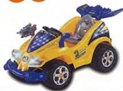
PC-7166 L120 x W65 x H60CM