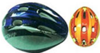
PC-0404 WITH PRINTING PVC OUTSIDE/EPS INSIDE 24PCS/CTN/6.14CUFT