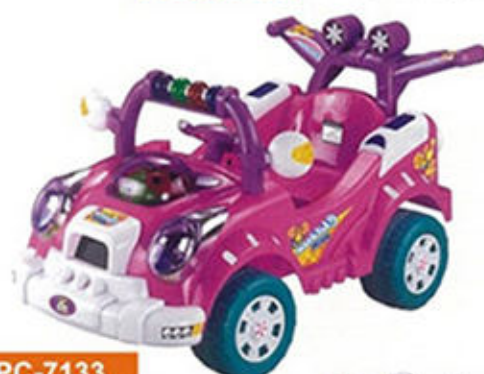
PC-7133 L103 x W62.5 x H54.5CM