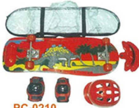
PC-0210 SK-30*10AAS SKATE BOARD FULL SET WITH MUSIC AND LIGHT BOX ALUMINIUM TRUCK AND ALUMINIUM BASE 55*47MM TRANSPARENT COLOR WHEELS KNEE AND ELBOW AND HELMET AND BAG 4SETS/CTN/2.50CUFT 3800SETS/HQ