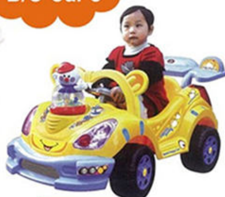
PC-7255 L95 x W62 x H53CM