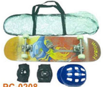
PC-0208 SK-31*8AAS SKATE BOARD FULL SET FULL ALUMINIUM TRUCK AND BASE 50*30MM PVC WHEELS 608Z STEEL BEARING KNEE AND ELBOW AND HELMET AND PVC BAG 6SET/CTN/3.10CUFT 4560SETS/HQ