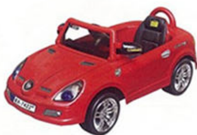
PC-7422 L108 X W61 X H44.5 CM