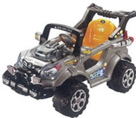
PC-7188 L118.5 x W71 x H69CM