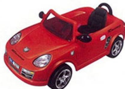
PC-7277 L120 x W65 x H60CM