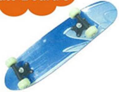
PC-0203 CHILDREN SKATE BOARD SK-24*6PP SINGLE KICK SHAPE 608Z STEEL BEARING AND PVC WHEELS 6PCS/CTN/1.55CUFT 9300PCS/HQ