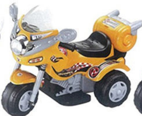
PC-306 L80 x W46 x H60CM