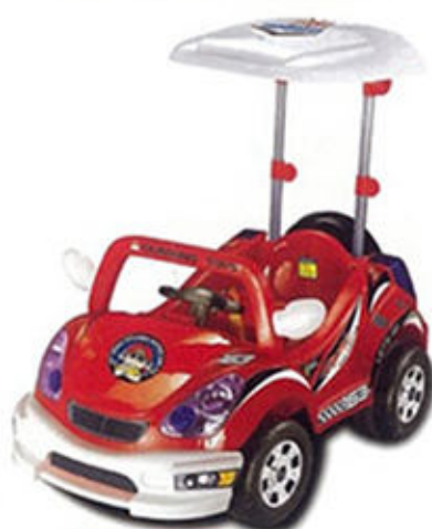
PC-7111-2 L95 x W62 x H53CM