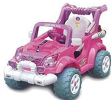
PC-7177 L118.5 x W71 x H69CM