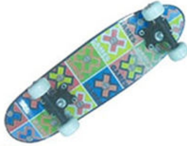
PC-0202 CHILDREN SKATE BOARD SK-21*6PP SINGLE KICK SHAPE 608Z STEEL BEARING AND PVC WHEELS 6PCS/CTN/1.07CUFT 13440PCS/HQ