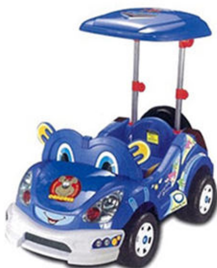
PC-7100-2 L95 x W62 x H53CM