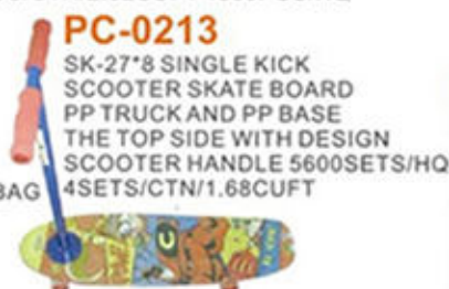
PC-0213 SK-27*8 SINGLE KICK SCOOTER SKATE BOARD PP TRUCK AND PP BASE THE TOP SIDE WITH DESIGN SCOOTER HANDLE 5600SETS/HQ 4SETS/CTN/1.68CUFT