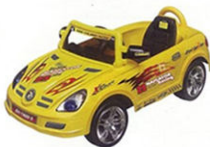
PC-7422-3 L108 X W61 X H44.5 CM