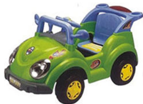
PC-801A L95 x W60 x H55CM