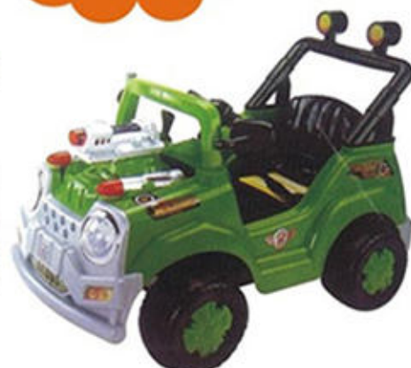
PC-805 L108X W82 X H71CM