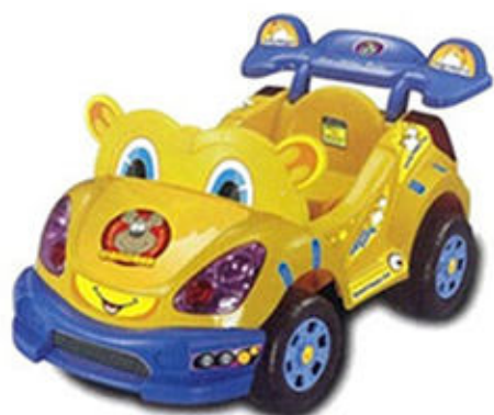
PC-7100 L95 x W62 x H53CM