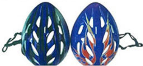
PC-0407 WITH PRINTING PVC OUTSIDE/EPS INSIDE 24PCS/CTN/6.14CUFT