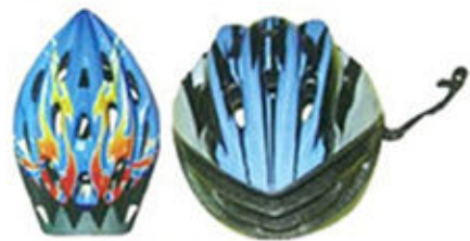
PC-0409 ADJUSTABLE SIZE HELMET WITH PRINTING PVC OUTSIDE/EPS INSIDE 24PCS/CTN/6.14CUFT