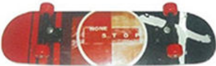
PC-0204 SK-31*8PP DOUBLE KICK PROFESSIONAL STYLE HIGH QUALITY STRONGER PP TRUCK AND BASE 50*36MM PVC WHEELS 608Z STEEL BEARING 4PCS/CTN/2.12CUFT 4560PCS/HQ