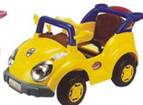
PC-801 L95 x W60 x H55CM