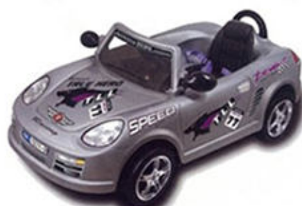
PC-7277-3 L120 x W65 x H60CM