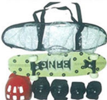
PC-0203 CHILDREN SKATE BOARD SET SK-24*6PP SINGLE KICK SHAPE 608Z STEEL BEARING AND PVC WHEELS KNEE.ELBOW PADS HELMET AND CARRY BAG 6SETS/CTN/2.46CUFT 5700SETS/HQ