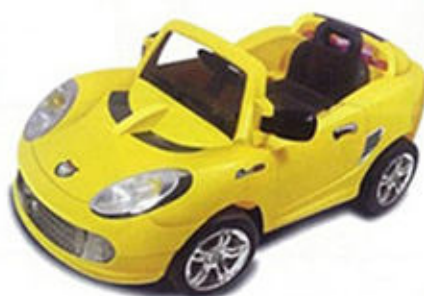
PC-7266 L115 x W67.5 x H49.5CM