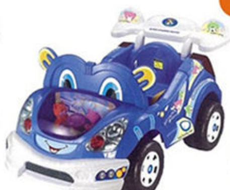
PC-7288 L95 x W62 x H53CM